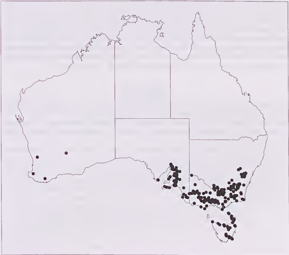
Fig. 4. Distribution of specimens of Cymbonotus preissianus in Australia. (data courtesy Australia's Virtual Herbarium)